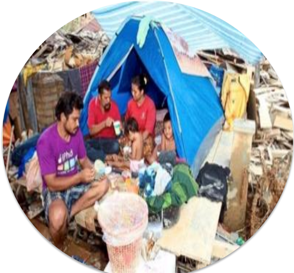
Drinking water contamination during emergency situation