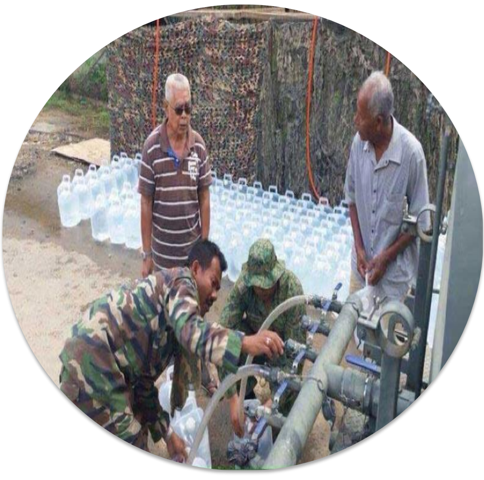
Require electricity & pumps