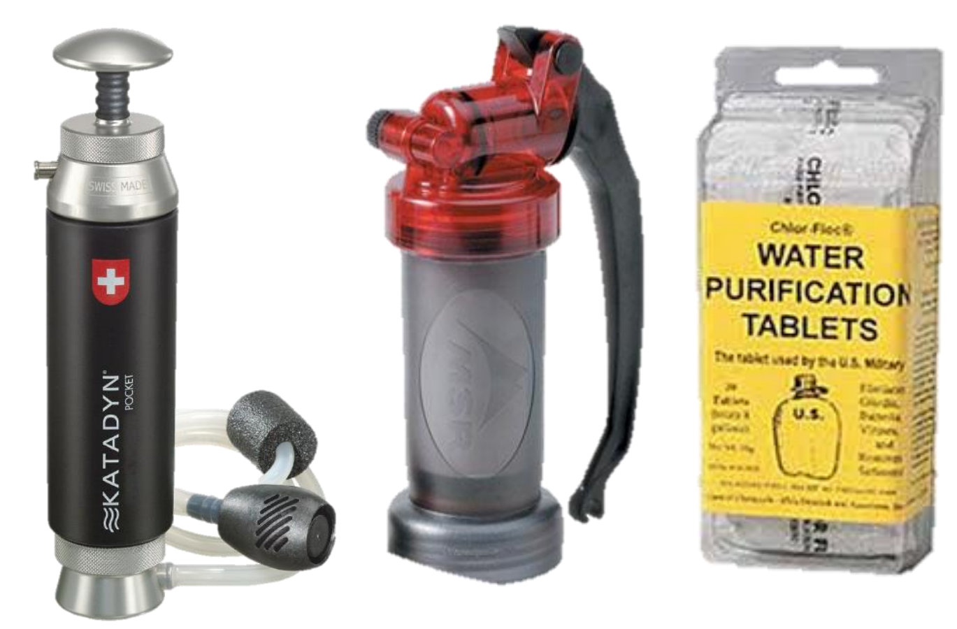
Point-of-use water purification